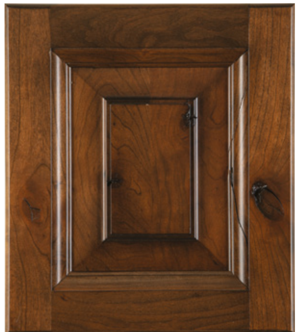
TDL 111 Substrate: Alder Color: Fireside