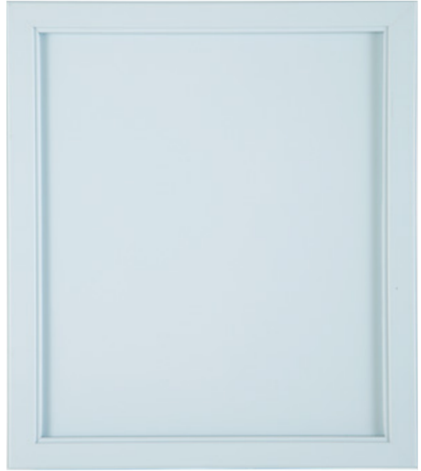
TSL 113 Substrate: Maple Color: Wedgewood