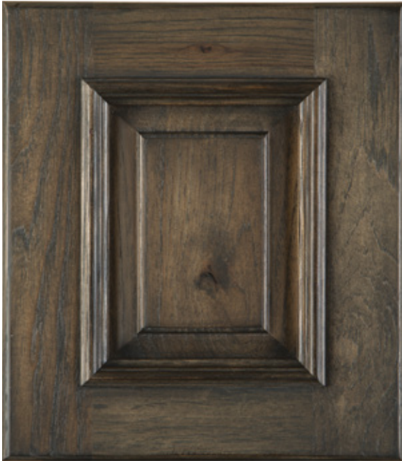
TDL 108 Substrate: Pecan Color: River Rock