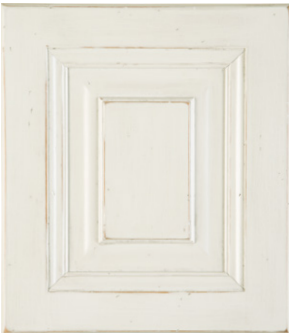
CTG 134 Substrate: Maple Color: Sea Island