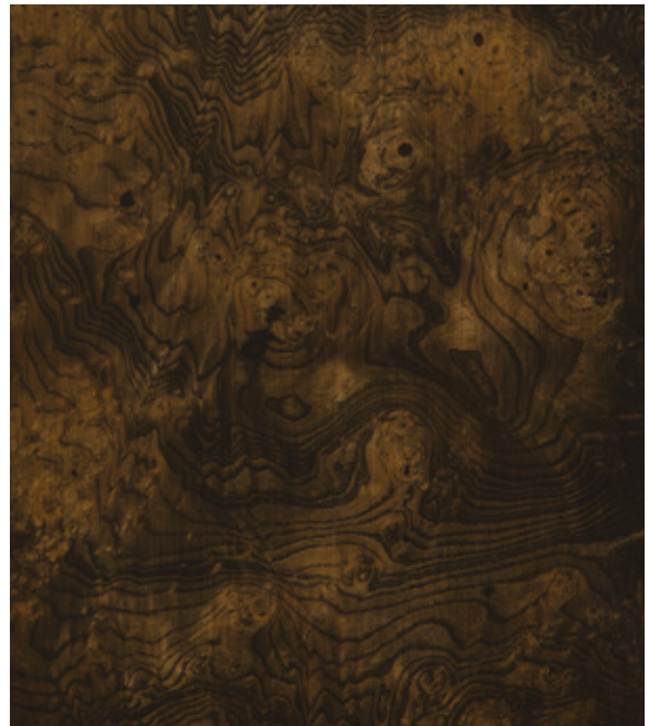
CTP 147 Substrate: Ash Burl Color: Gun Stock