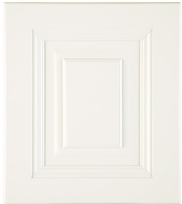
TDL 103 Substrate: Maple Color: Crushed Ice