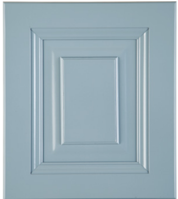
TDL 107 Substrate: Maple Color: Bright Skies