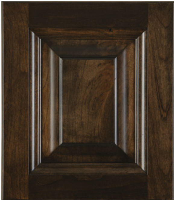
TDL 106 Substrate: Cherry Color: Cinder