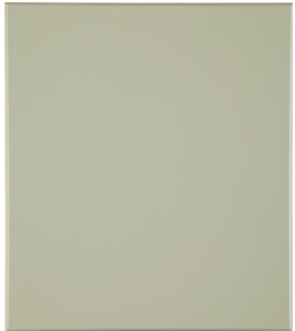
CTP 143 Substrate: Maple Color: Olive