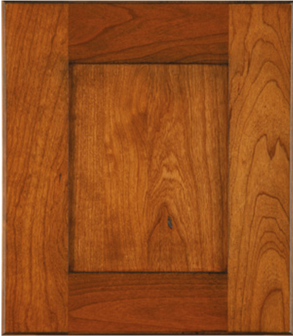
CTG 128 Substrate: Cherry Color: Michaels