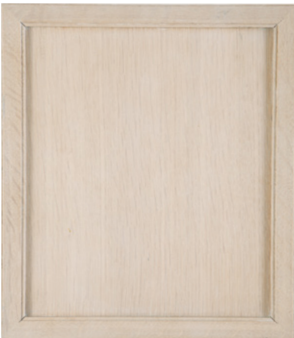
CTP 138 Substrate: Quartered Oak Color: Monterey