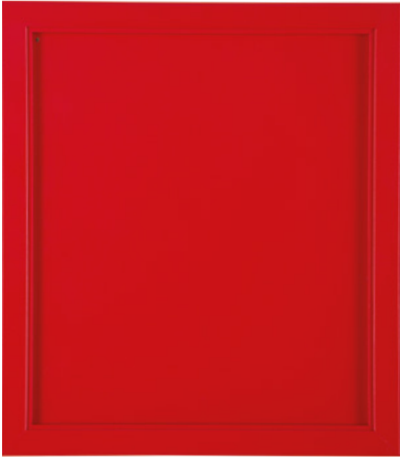
CTP 140 Substrate: Maple Color: Enzo