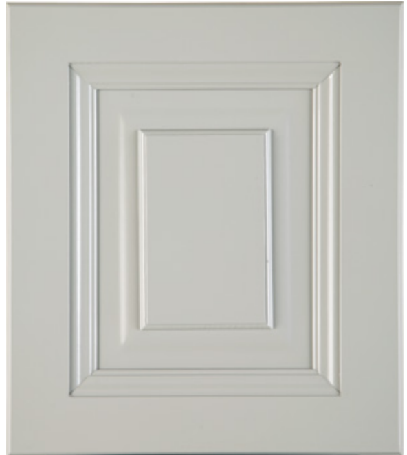
TDL 109 Substrate: Maple Color: Gray