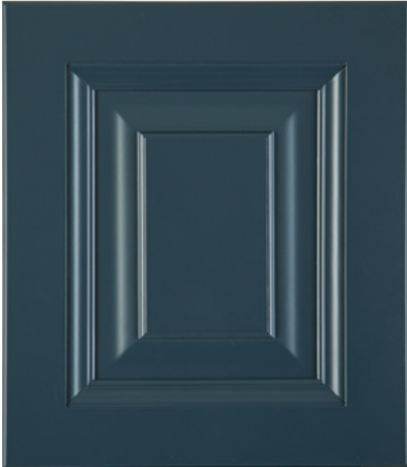
TDL 100 Substrate: Maple Color: Navy