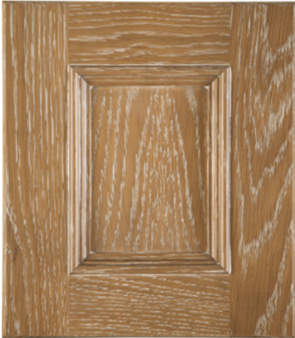
TSL 120 Substrate: Oak Color: Laurel