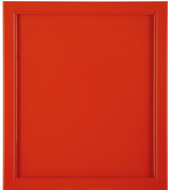
TSL 123 Substrate: Maple Color: Hurst