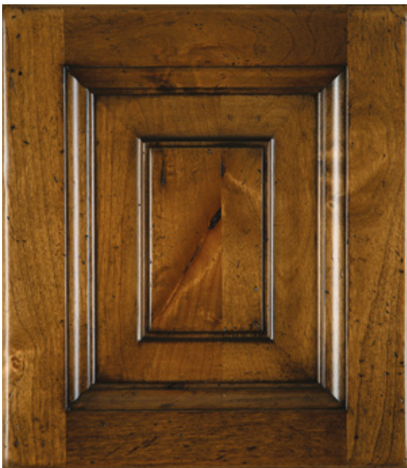
TDL 102 Substrate: Alder Color: Whisky