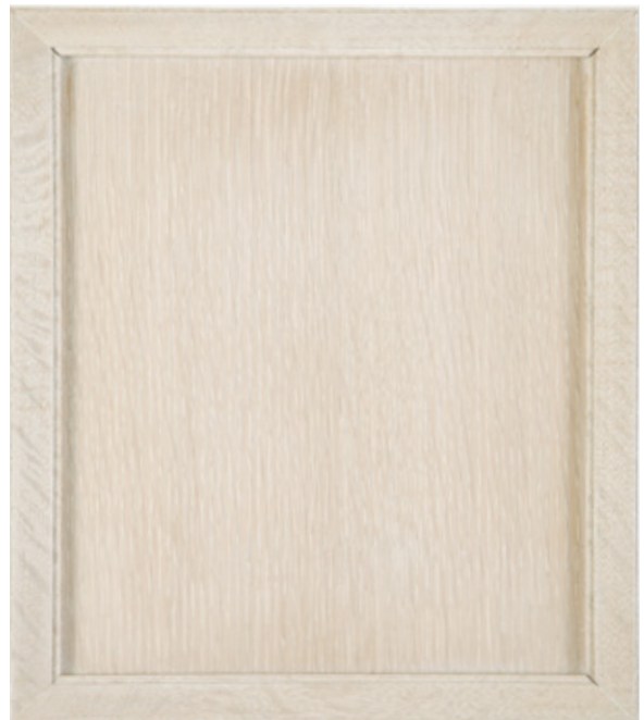
TSL 119 Substrate: Quartered Oak Color: Salted