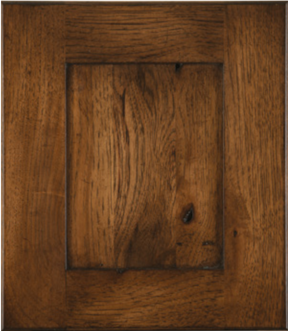
CTG 132 Substrate: Pecan Color: Crafted