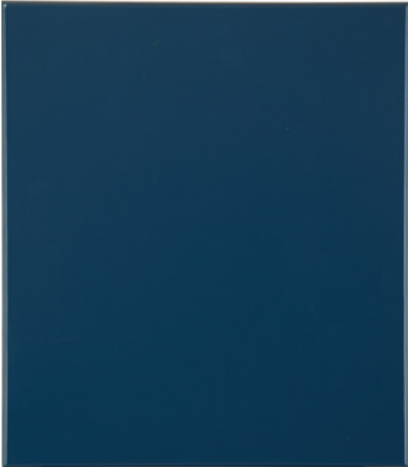
CTP 136 Substrate: Oak Color: Cobalt