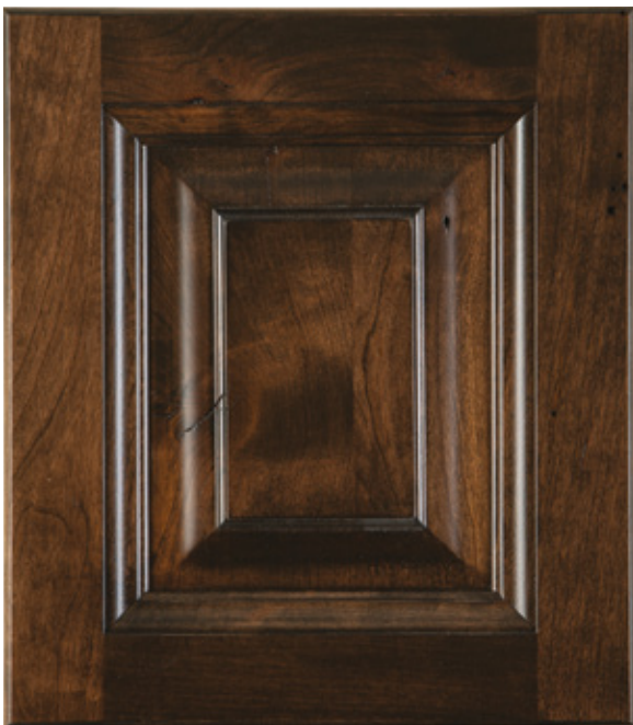
TDL 110 Substrate: Cherry Color: Biltmore