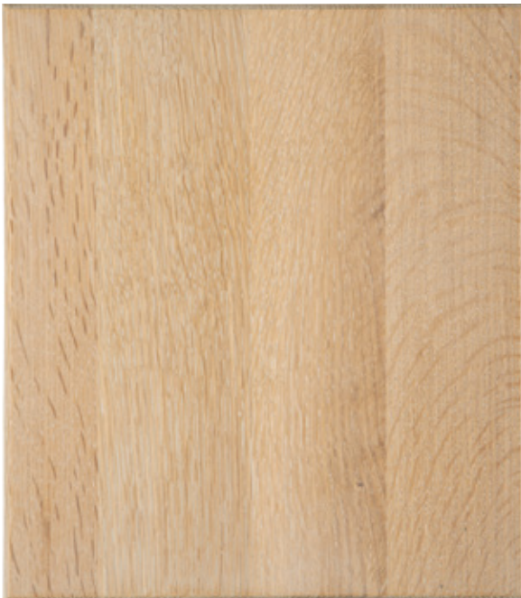
TSL 114 Substrate: Oak Color: Coronado