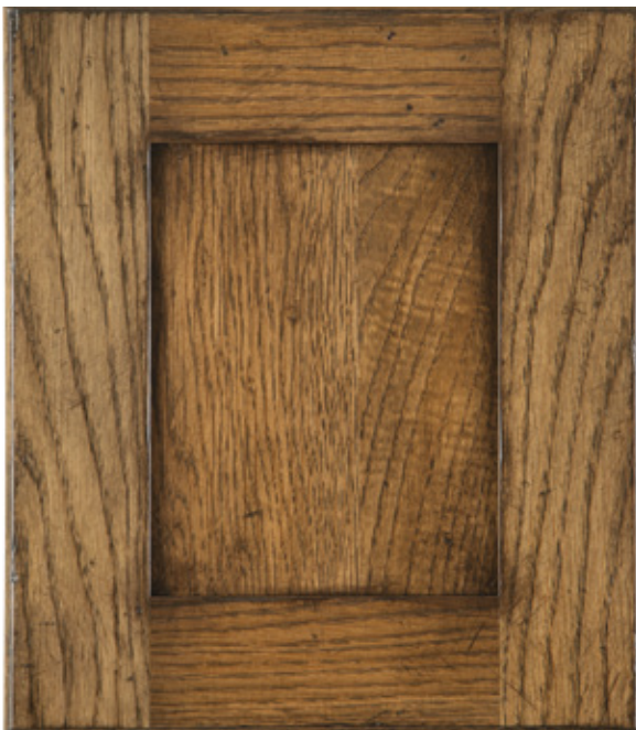
CTG 130 Substrate: Oak Color: Wheated