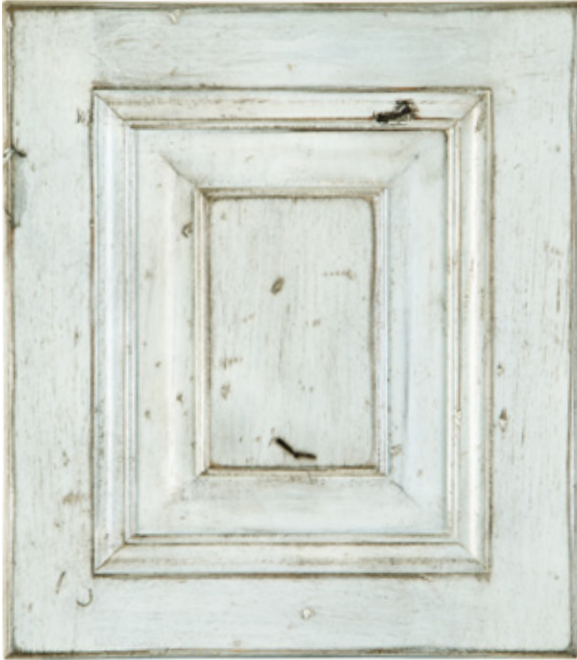
CTG 124 Substrate: Rustic Birch Color: Magnolia