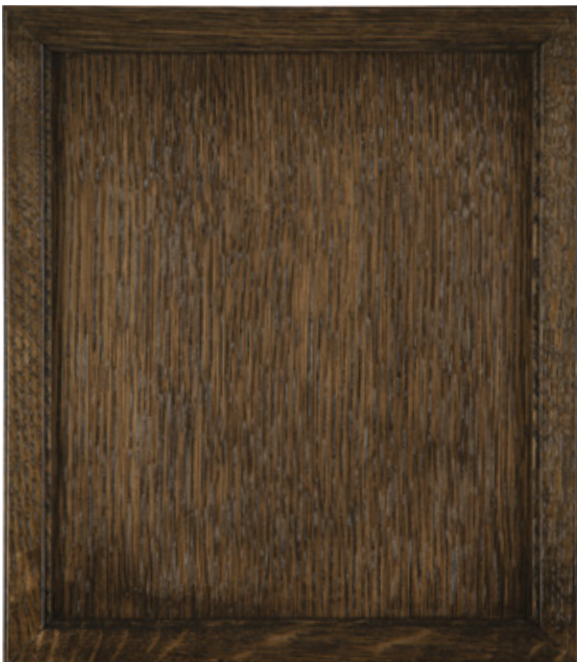
TSL 118 Substrate: Quartered Oak Color: French Barrel