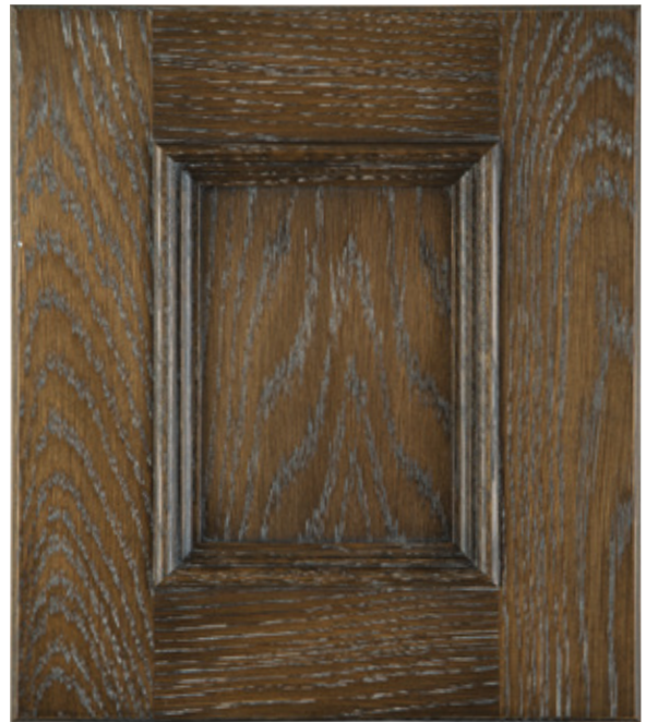
TSL 115 Substrate: Oak Color: Elder