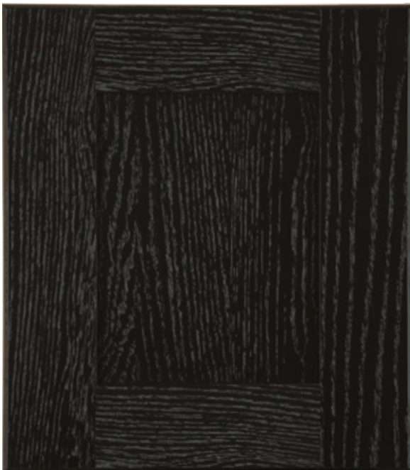
TSL 122 Substrate: Quartered Oak Color: Noire