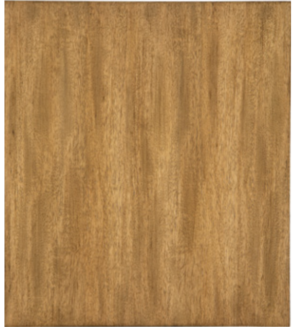
CTP 137 Substrate: Prima Vera Color: Coda