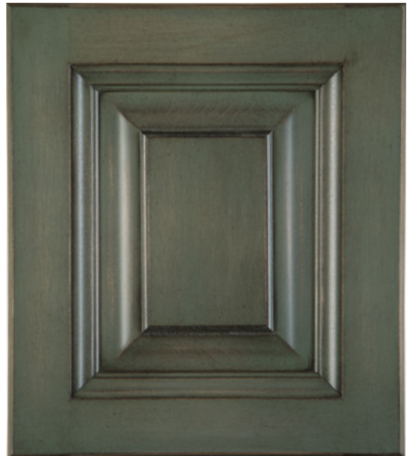
CTG 127 Substrate: Maple Color: Evergreen