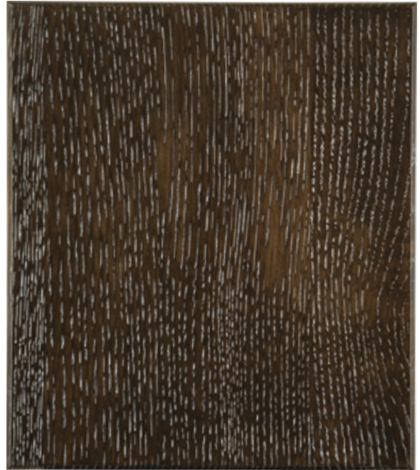
TSL 117 Substrate: Quartered Oak Color: Briar