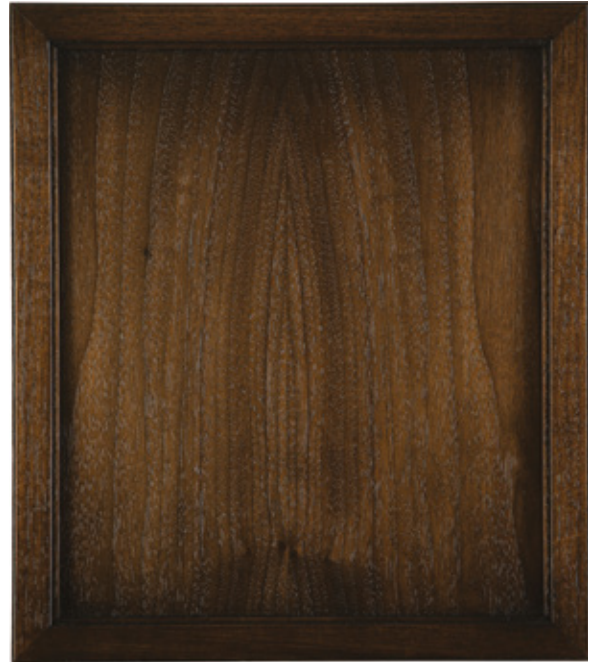
CTP 141 Substrate: Walnut Color: Tobacco