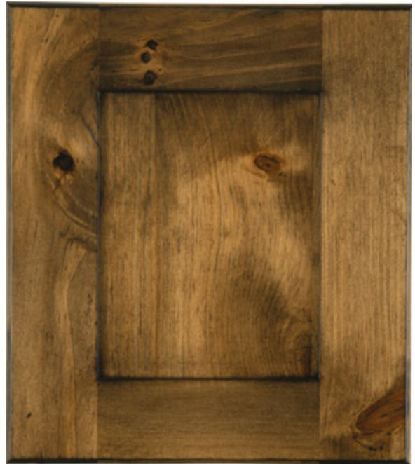
CTG 129 Substrate: Pine Color: Palmer