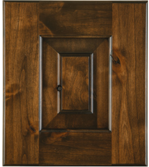
TDL 105 Substrate: Alder Color: Saddle