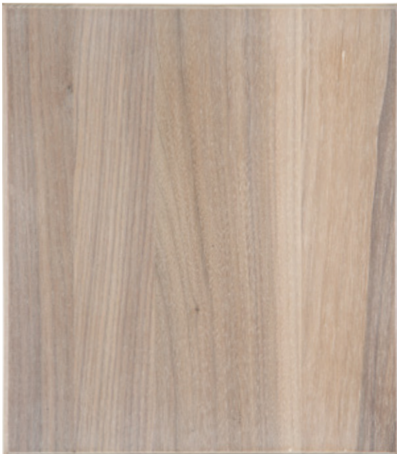
CTP 146 Substrate: Walnut Color: Mist