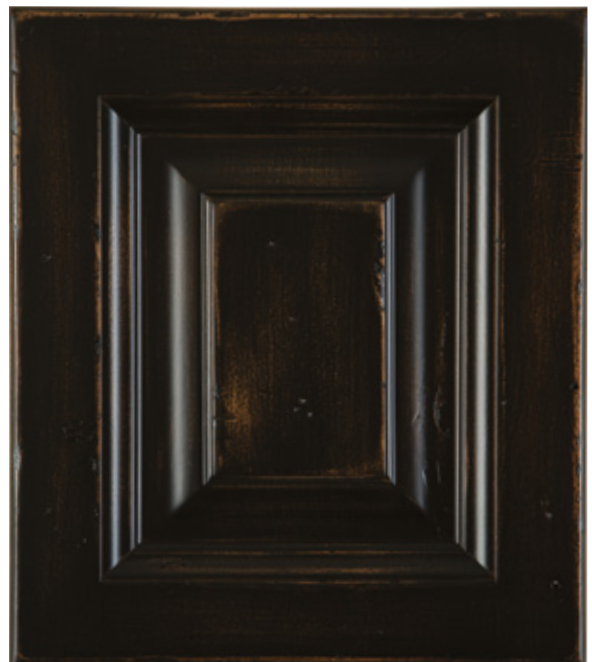
CTG 131 Substrate: Cherry Color: Onyx