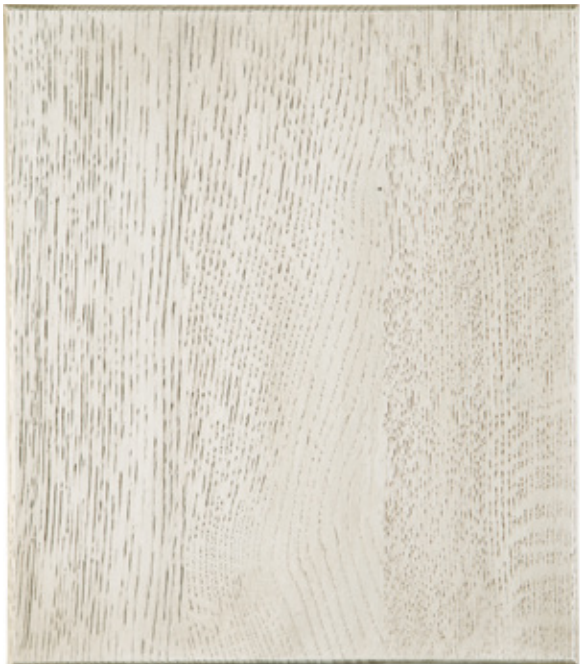
CTP 142 Substrate: Quartered White Oak Color: Fossil