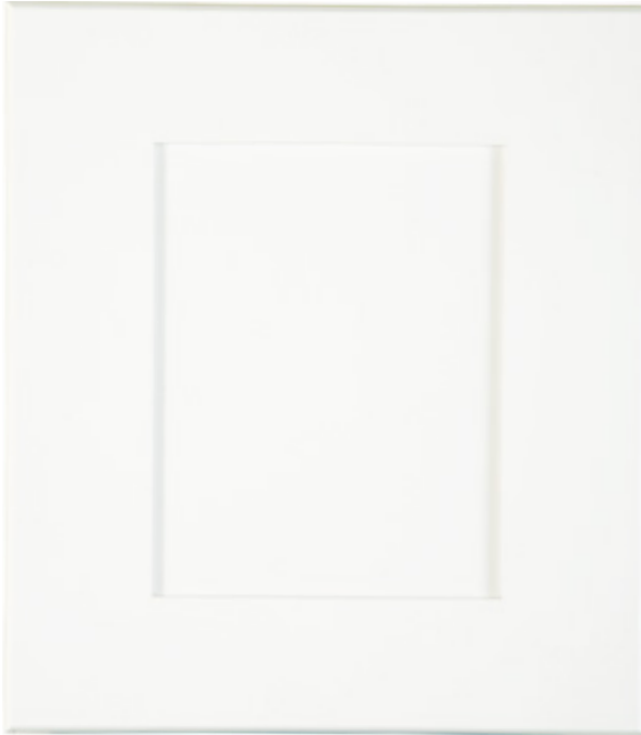
TSL 116 Substrate: Maple Color: Hampton