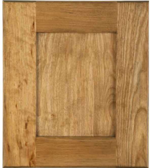
CTG 133 Substrate: Birch Color: Salem