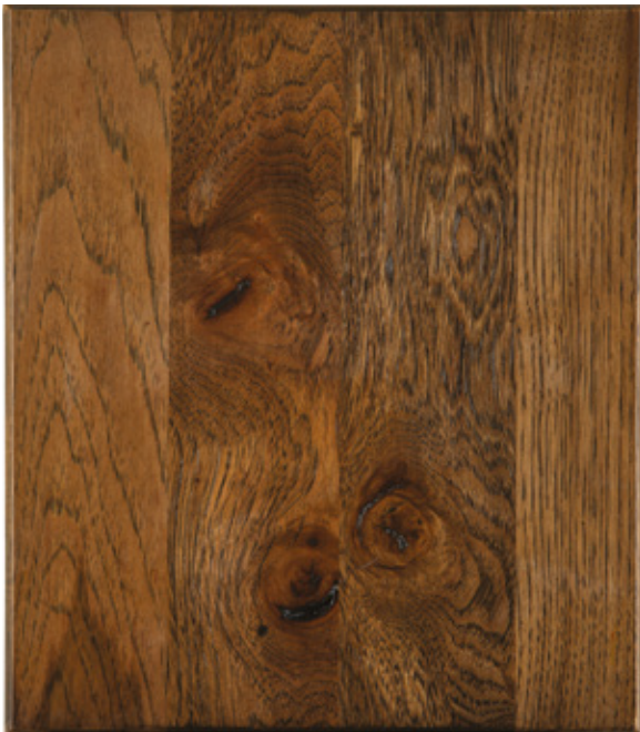
CTG 126 Substrate: Pecan Color: Sedona