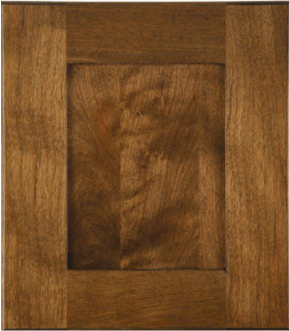
TSL 112 Substrate: Cherry Color: Rye