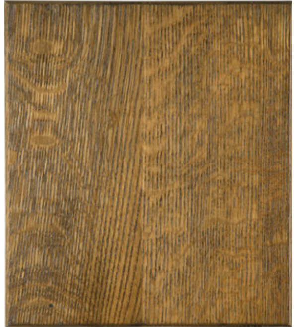
CTG 125 Substrate: Flaky Oak Color: Dutton