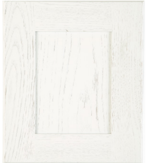
TSL 121 Substrate: Oak Color: Charisma