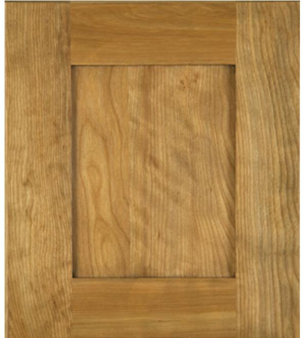
CTP 145 Substrate: Birch Color: Newport