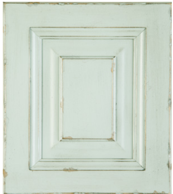
CTG 135 Substrate: Maple Color: Twig