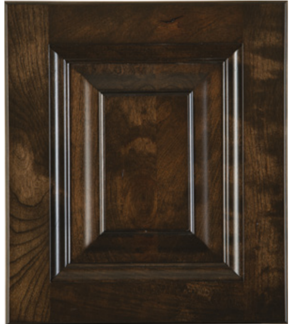
TDL 101 Substrate: Cherry Color: Mink