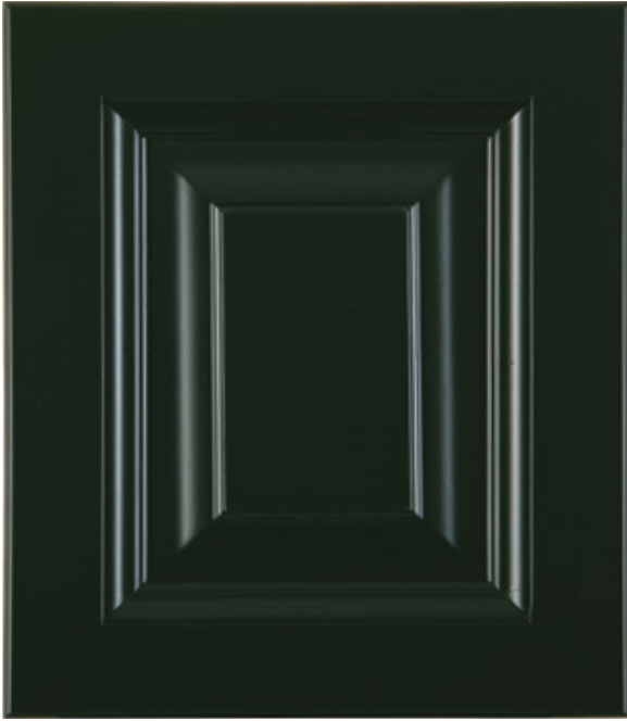
TDL 104 Substrate: Maple Color: Charleston Green