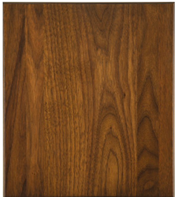
CTP 139 Substrate: Walnut Color: Eames